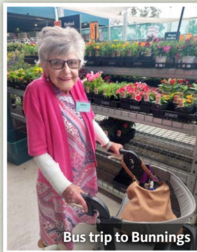
Bus trip to Bunnings