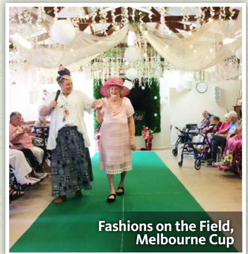
Fashions on the Field, Melbourne Cup