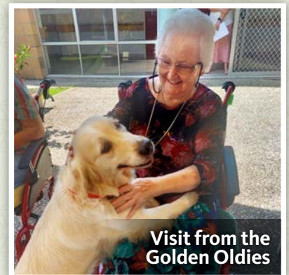
Visit from the Golden Oldies