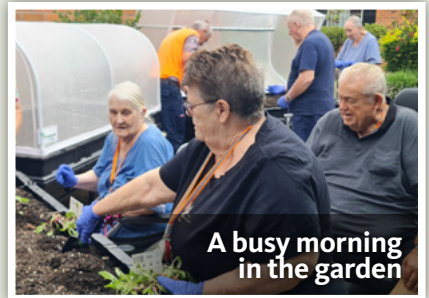
A busy morning in the garden