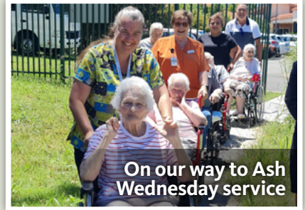
On our way to Ash Wednesday service