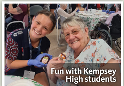
Fun with Kempsey High students

88 Leith Street, Kempsey NSW 2440 P (02) 6562 6062