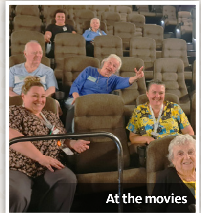
At the movies