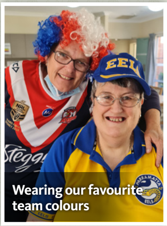
Wearing our favourite team colours