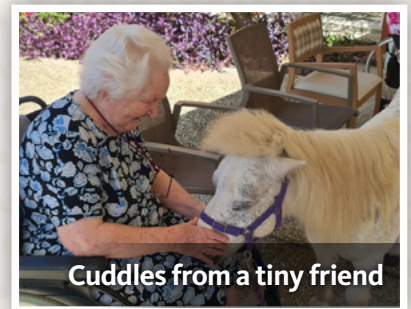
Cuddles from a tiny friend