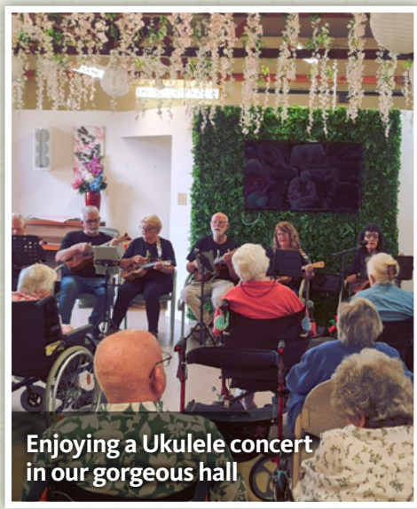
Enjoying a Ukulele concert in our gorgeous hall