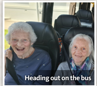
Heading out on the bus