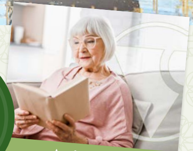
Aged care guide

Free Aged Care Guide available on our website